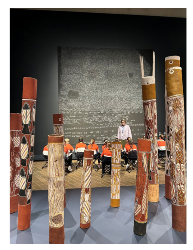
The Aboriginal Memorial at The National Gallery, Canberra 2024