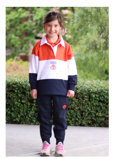
Winter Uniform - Kinder/Prep