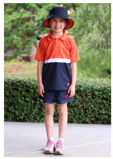
Summer Uniform - Kinder/Prep

NB. School sun hats and Library bags are compulsory for all Junior School students. Polo tops must not be worn over skivvies.